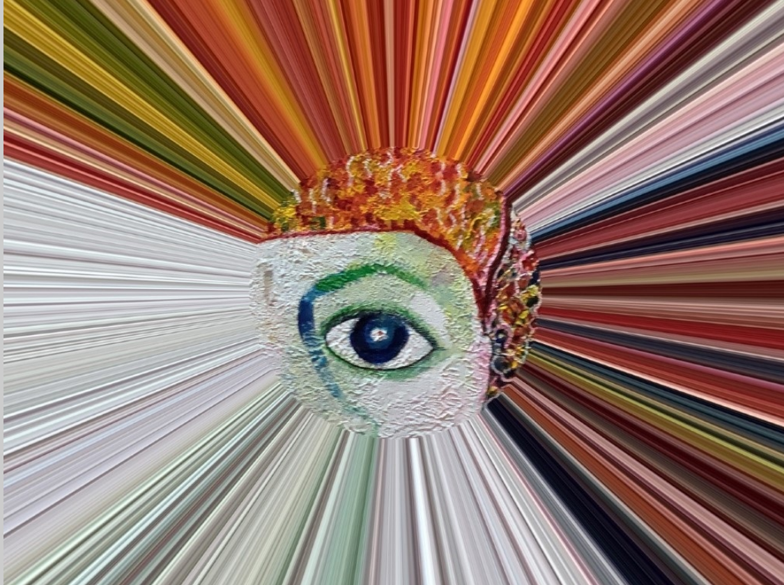
Pamela Mackey, 2020